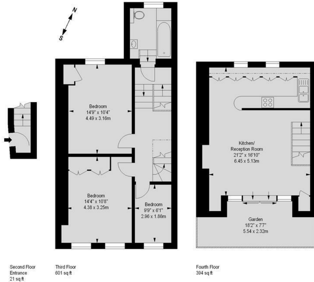
Illustration For Identification Purposes Only. Not To Scale *Floorplan Drawn According To RICS Guidelines

Whilst these particulars are produced in good faith and are believed to be correct, no guarantee is given, nor any responsibility accepted, by Tates nor by any of its representatives, for their accuracy. The particulars do not constitute part of any offer or contract, and it is recommended that such things as measurements, condition, structure, services, appliances, fixtures and fittings and facilities are all independently assessed by the prospective purchaser or renter of the subject property prior to committing to any contract.